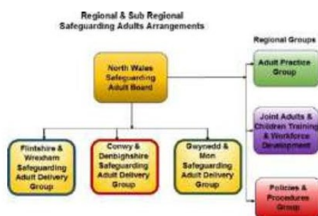
North Wales Safeguarding Adults Board